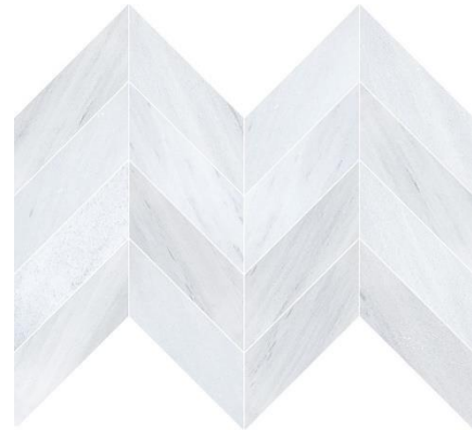
Solto White Marble 4x16 Chevron Honed MARB0815