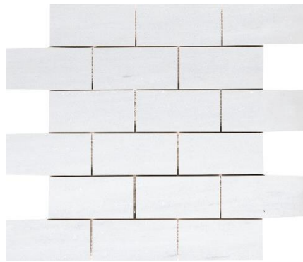
Solto White Marble 2x4 Honed Mosaic / MARB0812