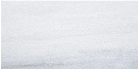
Solto White Marble 12x24 Honed MARB0805