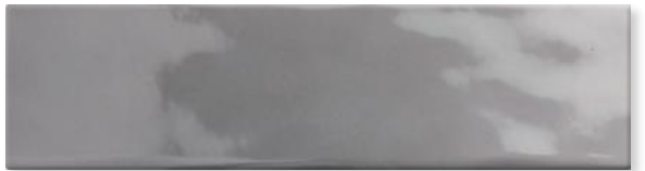
Eternity 3x12 Glossy Subway - Smoke CERT312ETYGRY