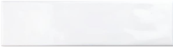
Eternity 3x12 Glossy Subway - Ice CERT312ETYWHT