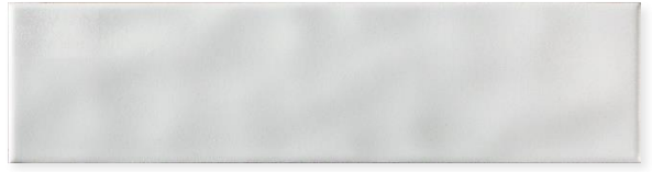
Eternity 3x12 Subway - Ice Matt CERT312ETYMTI